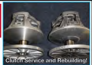
Clutch Service and Rebuilding!

We are a Complete CNC Polaris Motor Rebuild Shop that Specializes in building motors to Better Than Factory Quality and Performance!