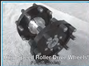
High Speed Roller Drive Wheels! (For most models)