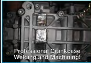
Professional Crankcase Welding and Machining!

Indy Specialty 651-388-9045 23503 145th Avenue • Welch, MN 55089